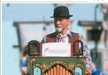
Fly to Warsaw with easyJet